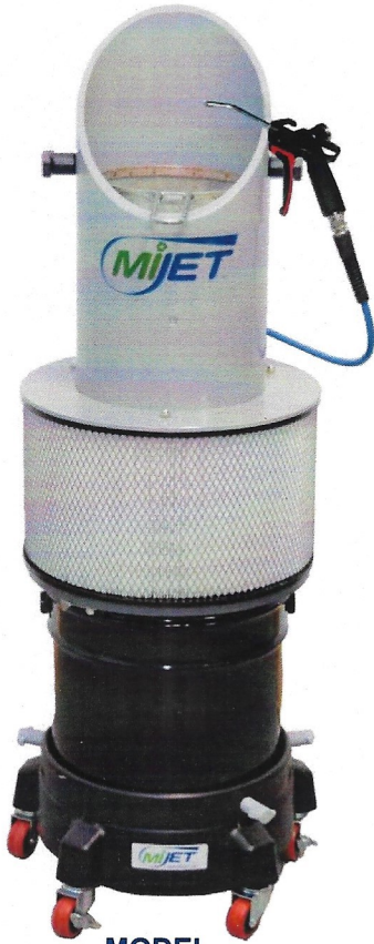
MODEL 114-8FL-545: 8"