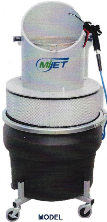
MODEL 15-12SX-20ANG: 12"